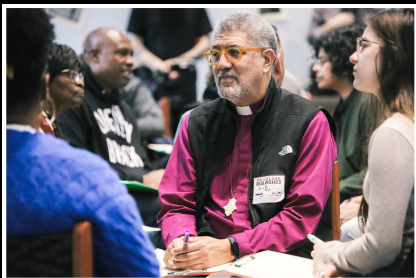
Winter Atlanta Leadership Forum

Fearless Dialogues also offers the following a la carte services: curriculum analysis, evaluation, and review; program audits; sourcing of content experts for online speaker series sessions.